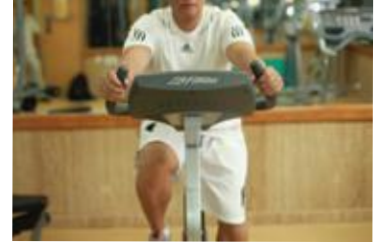
• GYM & WELLNESS