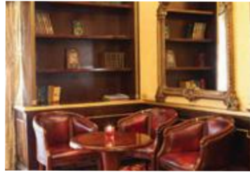
• TOLSTOY LOUNGE BAR