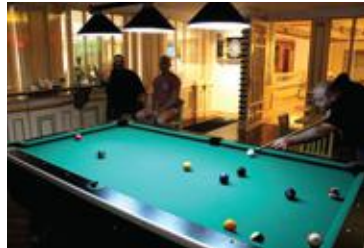
• HERO'S SPORTS BAR