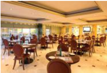
• VOLGA COFFEE SHOP