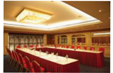
• CONFERENCE ROOM