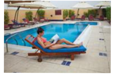
• ROOFTOP SWIMMING POOL