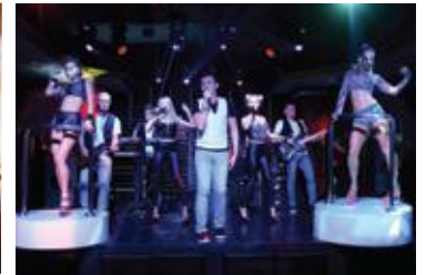
• RED SQUARE DISCOTHEQUE